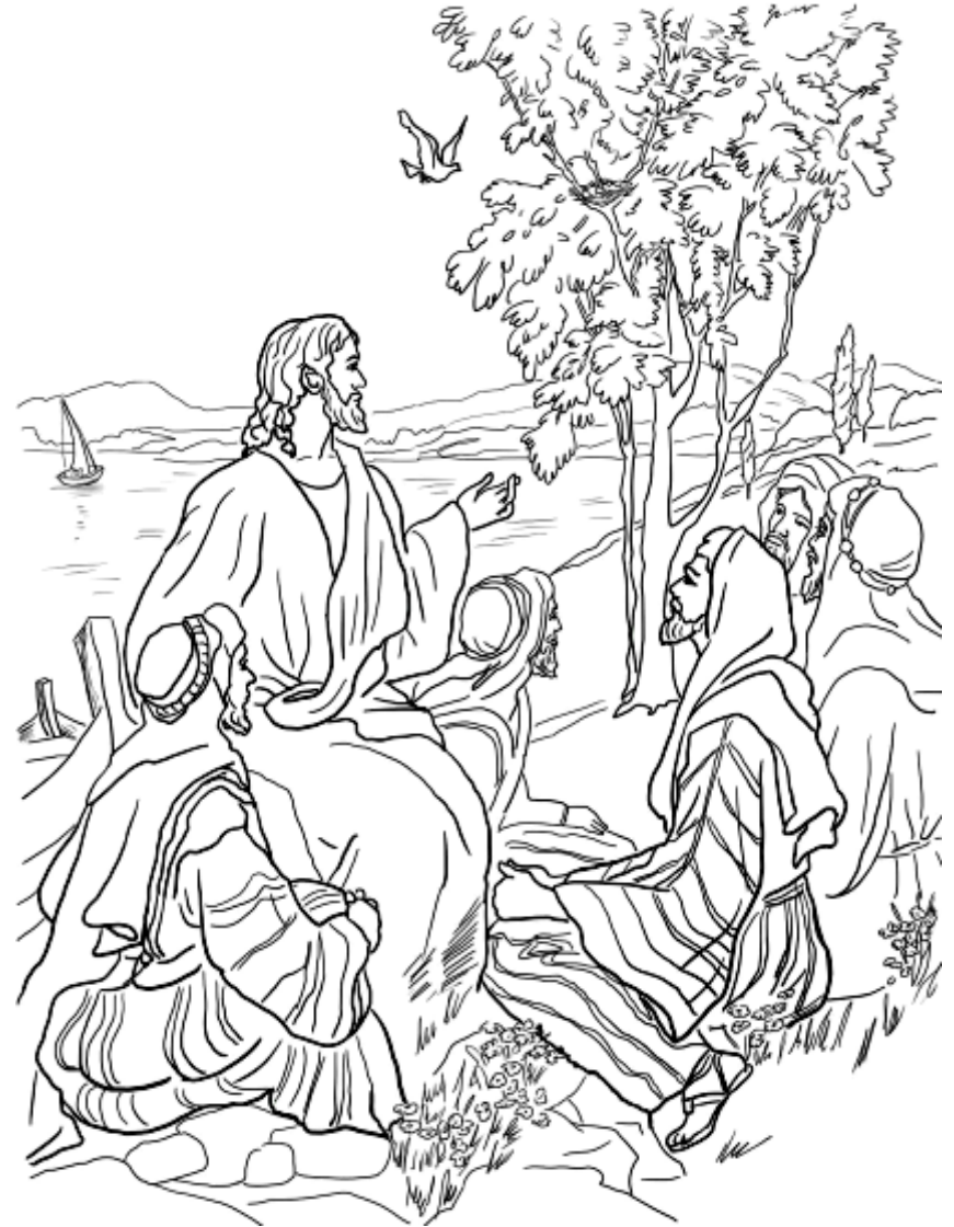
The Parable of the Mustard Seed Mark 4:30-3